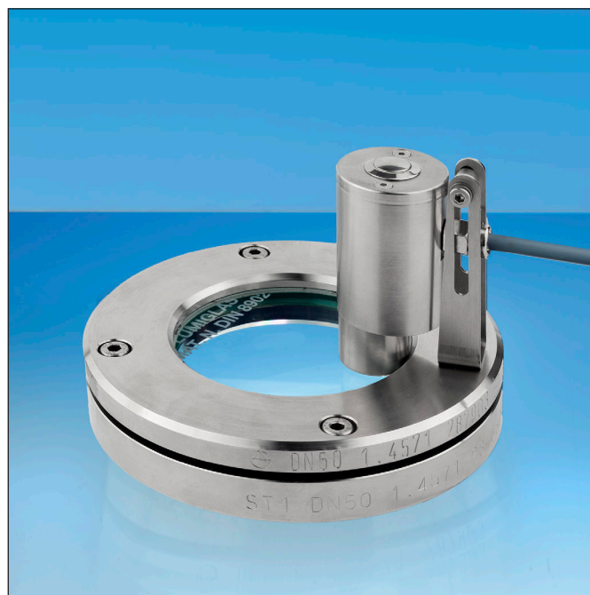
Lumistar luminaire ESL 51LED KS adapted to a standard flange