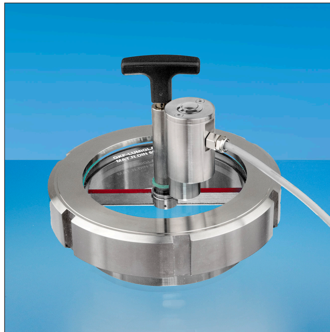
Lumistar luminaire ESL 51LED HK installed on a screwed sight glass fitting equipped with Lumiglas wiper unit SW I