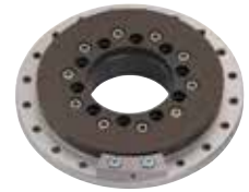
PRT with fitted manual clamp