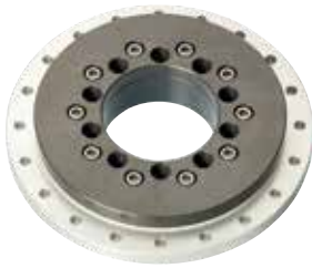
High temperature up to +180°C