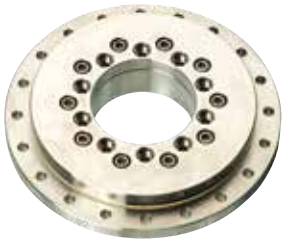
Stainless steel version