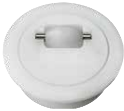
For high loads (HH)