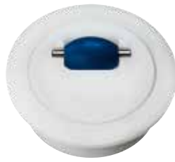
With soft roller made from xirodur® D180 (HS)