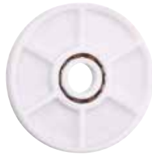
PA cage, glass balls