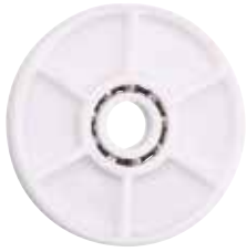
PA cage, stainless steel balls