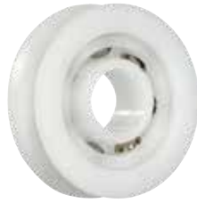
xirodur® B180 cage, stainless steel balls Type 608P6