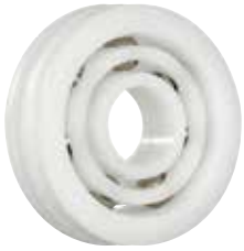
xirodur® B180 cage, stainless steel balls Type 6000PP3