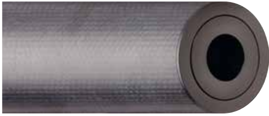
Carbon fibre tube with xirodur® S180 ball bearing, available as ESD version (with xirodur® F180 ball bearing)