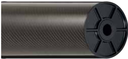
Carbon fibre tube with xirodur® F180 ball bearing