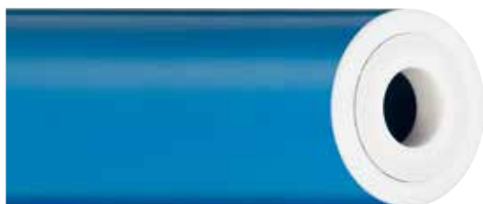
PVC tube with xirodur® B180 ball bearing