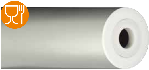
Aluminium tube with xirodur® B180 ball bearing