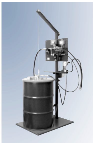
SAF Pump with Stand and Winch (Drum Supplied by Lubricant Supplier)

These pneumatic barrel pumps, SAF1-YL with one outlet and SAF2-YL with two outlets are designed for use in spray systems for the supply of adhesive lubricants (NLGI 0 and 00). SAF pumps are placed directly into 200 liter drums. They do not require a follower plate, thus the supply of lubricant is possible even if the drum is severely dented. With the aid of an optional stand and winch unit, it is easy to exchange barrels.